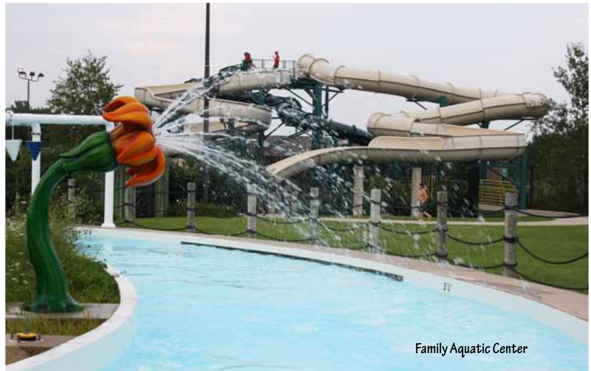
Family Aquatic Center

On inclement weather days when lunches are delivered to the camp sites, chips will be substituted for french fries.