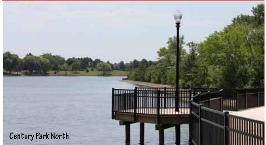
Century Park North

May 1 .....Camp Calendars available Online June 1 .....Session 1 Camper Data Forms Due July 1 .....Session 2 Camper Data Forms Due