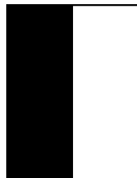
1/2 Page Vertical

8" (w) x 5.1875" (h) Interior Cover Pages $700